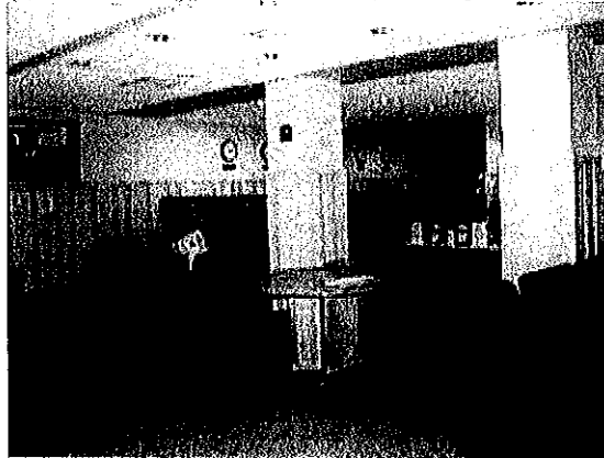
Figure 5. Dartmouth Baker/Berry Library News Center

resources. Indiana University Bloomington has created a quiet information commons on a floor above the bustling main information commons. Information commons will encompass new models and variations, with a wide variety of names, but all will support learning by integrating technology, content, and services in physical space.