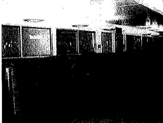
Figure 4. Diner-Style Seating at University of Nevada Las Vegas Library

Portable whiteboards, used in only a few information commons, might be more widely adopted for sharing information and defining group space in an open area. (See Figure 4.)